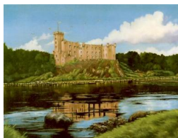
Historical Castle on the Isle of Skye

Isle of Skye, IV55 8WF, Western Isles, Scotland