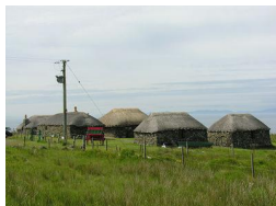
The Skye Museum of Island Life at Kilmuir

Visitor Centres and Museums, Indoor and Outdoor Play Areas