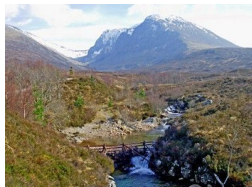
Nevis Range Fort William Mountain Experience

Indoor and Outdoor Play Areas, Cafes Coffee Shops and Tearooms, Cycling and Mountain Bikes, Walking and Climbing, Winter Sports, Bike Hire, Guided Tours and Day Trips, Guided Walks