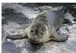
Boat Trips and Seal Sightings

Plockton, IV52 8TN, The Highlands, Scotland