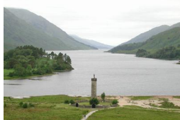
Historical Monument and Visitors Centre

Historic Buildings and Monuments, Visitor Centres and Museums, Cafes Coffee Shops and Tearooms