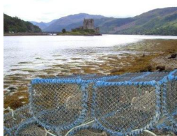
One of the most iconic castles in the world

Kyle of Lochalsh, IV40 8DX, The Highlands, Scotland