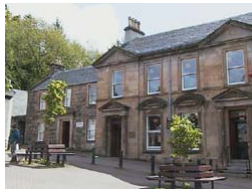
Museum of and for the West Highlands

Fort William, PH33 6AJ, The Highlands, Scotland