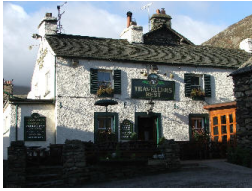
Ideal walkers pub in Glenridding