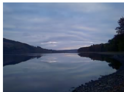
Loch Venachar, The Trossachs

Callander, FK8 3EN, Stirlingshire, Scotland