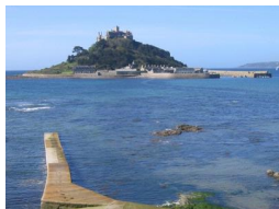
Medieval Castle and Church