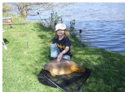
Carp and coarse fishing on three scenic lakes. Catch carp in excess of 40 lbs