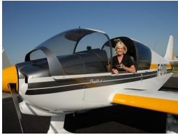
French flying club with English lady instructor who teaches in English

Tours and Trips, Guided Tours and Day Trips