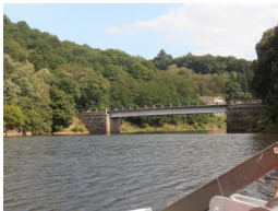
The lake lies in the heart of the Creuse valley near Éguzon-Chantôme and covers 312 hectares.