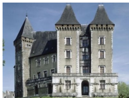
Most Important Chateau of the Bearn

Pau, 64000, Pyrenees-Atlantiques, France