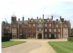
Much loved Norfolk retreat of HM The Queen

Historic Buildings and Monuments, Parks Gardens and Woodlands, Visitor Centres and Museums