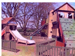
A countryside park for all seasons with activities for all ages