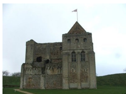
One of the most famous 12th Century castles in England.