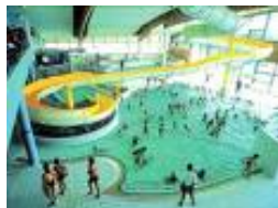
Indoor Pool Complex