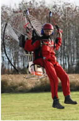
Microflight and Parafmotor Training and Air Base

Navarrenx, 64190, Pyrenees-Atlantiques, France