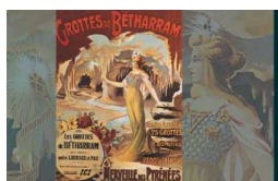
Natural caves with staligmites and lake and train

Historic Buildings and Monuments, Tours and Trips, Childrens Attractions