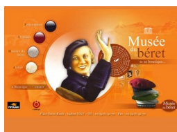
Everything you wanted to know about Berets!

Nay, 64800, Pyrenees-Atlantiques, France