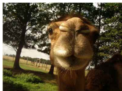
Animal Park and Farm