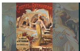
Natural caves with staligmites and lake and train

Historic Buildings and Monuments, Tours and Trips, Childrens Attractions