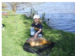
Carp and coarse fishing on three scenic lakes. Catch carp in excess of 40 lbs