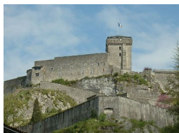
Castle fort of Lourdes

Historic Buildings and Monuments, Visitor Centres and Museums