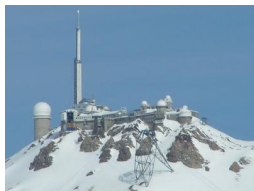
Observatory and Museum on Mountain Peak - by cable car

La Mongie du Midi, 65200, Hautes-Pyrenees, France