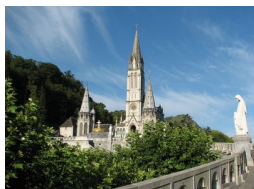
World Famous Pilgrimage Destination

Historic Buildings and Monuments, Visitor Centres and Museums