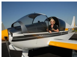
French flying club with English lady instructor who teaches in English

Tours and Trips, Guided Tours and Day Trips