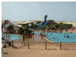
Aqua and Leisure Park