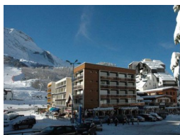
Ski Resort in the Pyrenees

Gourette, 64400, Pyrenees-Atlantiques, France