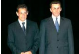
Wax Museum of Famous French People Past & Present

Tours and Trips, Visitor Centres and Museums