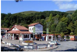
Antique Wooden Train climbs to summit of La Rhune

Sare, 64310, Pyrenees-Atlantiques, France