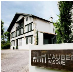
2009 1star Michelin Restaurant

Helbarron Saint-Pee, 64310, Pyrenees-Atlantiques, France