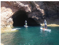
Stand Up Paddleboarding at Baleal, Peniche & Obidos. We have some amazing adventures including a River Paddle visiting the Berlengas Islands!