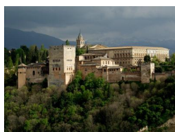
The most famous touristic site of Spain. The Alhambra is located in the city of Granada (Andalusia). It's a very beautiful Morish Castle and very well maintained.

Art Gallery, Historic Buildings and Monuments, Tours and Trips, Visitor Centres and Museums