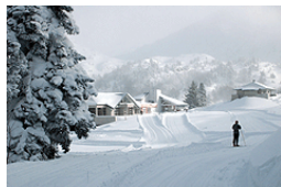
Ski Station in the Pyrenees

Urdos, 64490, Pyrenees-Atlantiques, France