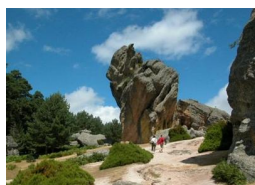
We offer cultural walking holidays in Soria, Northern Spain