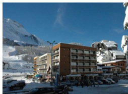
Ski Resort in the Pyrenees

Gourette, 64400, Pyrenees-Atlantiques, France