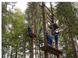
Tree-based adventures facing the Pyrenees

Childrens Attractions, Indoor and Outdoor Play Areas