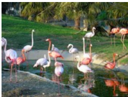
Tigers, snow panthers, maned wolves, parrots, kangaroos, or even marmosets ... there are over 100 species and 150 animals waiting to meet you.

Visitor Centres and Museums, Childrens Attractions, Zoos Farms and Wildlife Parks