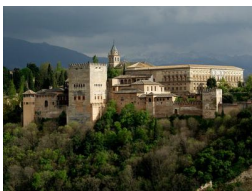
The most famous touristic site of Spain. The Alhambra is located in the city of Granada (Andalusia). It's a very beautiful Morish Castle and very well maintained.

Art Gallery, Historic Buildings and Monuments, Tours and Trips, Visitor Centres and Museums