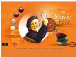
Everything you wanted to know about Berets!

Nay, 64800, Pyrenees-Atlantiques, France