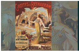
Natural caves with staligmities and lake and train

Historic Buildings and Monuments, Tours and Trips, Childrens Attractions