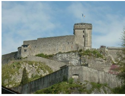
Castle fort of Lourdes

Historic Buildings and Monuments, Visitor Centres and Museums