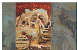
Natural caves with stalagmites and lake and train

Historic Buildings and Monuments, Tours and Trips, Childrens Attractions