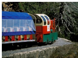
Pyrenean Mountain Railway

Tours and Trips, Childrens Attractions, Railways