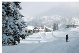
Ski Station in the Pyrenees

Urdos, 64490, Pyrenees-Atlantiques, France