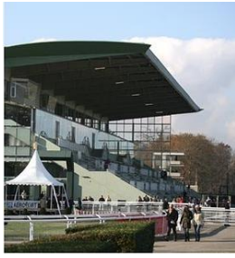
Restaurant at Pau Race Course

Pau, 64000, Pyrenees-Atlantiques, France