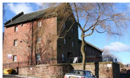
Visitor Centre and Exhibition

Dumfries, DG2 7BE , Dumfries and Galloway, Scotland