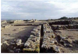
Roman wall snaking across dramatic countryside

Hexham, NE47 6NN, Northumberland, England