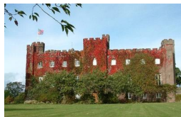
Scone Palace occupies a unique position in Scottish History

Historic Buildings and Monuments, Parks Gardens and Woodlands