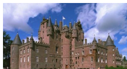
Childhood home of Her Majesty Queen Elisabeth The Queen Mother

Glamis, DD8 1RJ, Angus and Dundee, Scotland