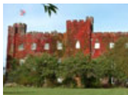
Former crowning place of the Kings of Scotland, stunning setting in beautiful grounds. A stately home to visit.

Historic Buildings and Monuments, Parks Gardens and Woodlands