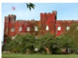
Former crowning place of the Kings of Scotland, stunning setting in beautiful grounds. A stately home to visit.

Historic Buildings and Monuments, Parks Gardens and Woodlands