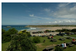
Freehouse Restaurant with stunning views on West Pentir Headland overlooking Crantock Beach, between Newquay and Perranporth