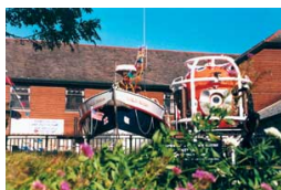
Varying exhibitions displaying artifacts from shipwrecks, local village life and the clay industry