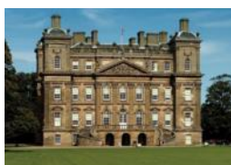
Historic House and Cultural Arts Centre

Art Gallery, Historic Buildings and Monuments, Cafes Coffee Shops and Tearooms, Shops