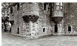
12th Century House

Kirkwall, KW15 1SG, Orkney Islands, Scotland