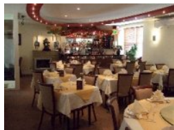
'A Hidden Gem' - Kelso Life July 2007

Kelso, TD5 7DN, Scottish Borders, Scotland