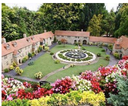
Thousands of miniature buildings, people and vehicles capture the essence of England's past, present and future