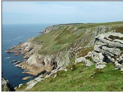
Lundy Island and Nature Reserve