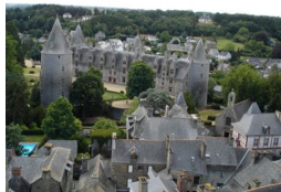
Josselin chateau in City of Josselin with half-timbered houses