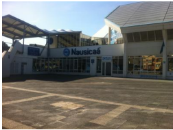
Sea life Center

Boulogne-sur-Mer, 62203, Pas-de-Calais, France