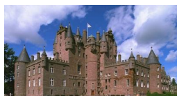
Childhood home of Her Majesty Queen Elisabeth The Queen Mother

Glamis, DD8 1RJ, Angus and Dundee, Scotland