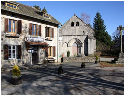
Local Bar and Restaurant