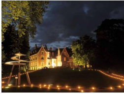
Château du Clos Lucé - Parc Leonardo da Vinci; Leonardo da Vinci's residence

Amboise - Val de Loire France, 37400, Indre-et-Loire, France