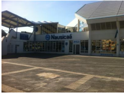
Sea life Center

Boulogne-sur-Mer, 62203, Pas-de-Calais, France