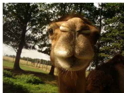
Animal Park and Farm