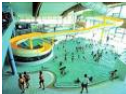
Indoor Pool Complex