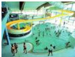
Indoor Pool Complex