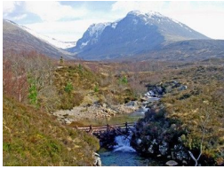
Nevis Range Fort William Mountain Experience

Fort William, PH33 6SW, The Highlands, Scotland