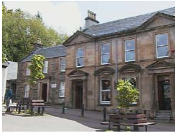
Museum of and for the West Highlands

Fort William, PH33 6AJ, The Highlands, Scotland