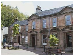
Museum of and for the West Highlands

Fort William, PH33 6AJ, The Highlands, Scotland