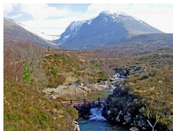
Nevis Range Fort William Mountain Experience

Fort William, PH33 6SW, The Highlands, Scotland