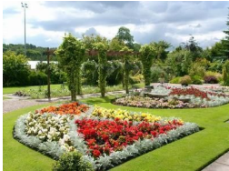
A unique visitor attraction that offers a tranquil break amidst beautiful floral displays.

Parks Gardens and Woodlands, Visitor Centres and Museums