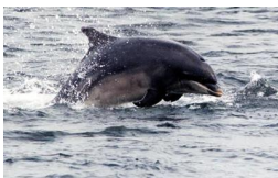
Boat cruises to see dolphins, ospreys, red kites, seals and much more

Tours and Trips, Childrens Attractions, Boat Trips