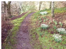
Highland Estate of High Nature Conservation

Balmacara, IV40 5DN, The Highlands, Scotland