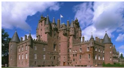
Childhood home of Her Majesty Queen Elisabeth The Queen Mother

Glamis, DD8 1RJ, Angus and Dundee, Scotland