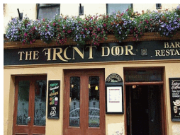
Popular pub in Galway