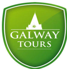
Guided walking tours of Medieval Galway

Tours and Trips, Guided Tours and Day Trips