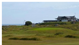
Connemara Golf Club

Clifden, Ireland, County Galway, Ireland