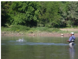
Fly Fishing with a Professional Guide

Pau, 64000, Pyrenees-Atlantiques, France