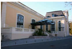
Major Casino and Conference Centre

Pau, 64000, Pyrenees-Atlantiques, France