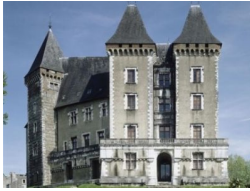
Most Important Chateau of the Bearn

Pau, 64000, Pyrenees-Atlantiques, France