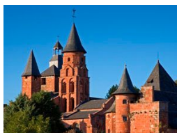
Beautiful red sandstone village, the very first 'Plus Beau Villages de France';

Historic Buildings and Monuments, Parks Gardens and Woodlands, Tours and Trips, Visitor Centres and Museums, Bistros and Brasseries, Cafes Coffee Shops and Tearooms, Restaurants, Theatres, Shops