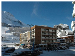
Ski Resort in the Pyrenees

Gourette, 64400, Pyrenees-Atlantiques, France