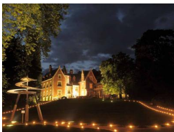
Château du Clos Lucé - Parc Leonardo da Vinci; Leonardo da Vinci's residence

Art Gallery, Historic Buildings and Monuments, Visitor Centres and Museums