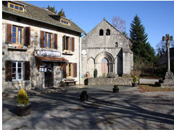
Local Bar and Restaurant