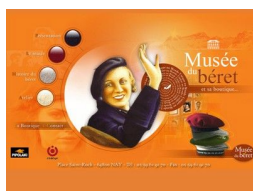
Everything you wanted to know about Berets!

Nay, 64800, Pyrenees-Atlantiques, France