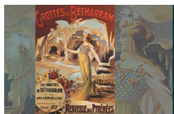
Natural caves with staligmites and lake and train

Historic Buildings and Monuments, Tours and Trips, Childrens Attractions