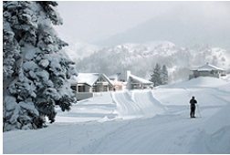
Ski Station in the Pyrenees

Urdos, 64490, Pyrenees-Atlantiques, France