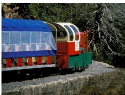
Pyrenean Mountain Railway

Tours and Trips, Childrens Attractions, Railways