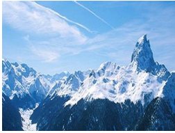
Ski Resort in the Pyrenees

Artouste-Fabreges, 64440, Pyrenees-Atlantiques, France